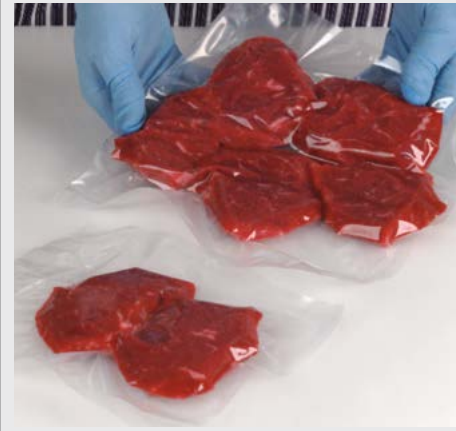
11. Vacuum pack in quantities required.