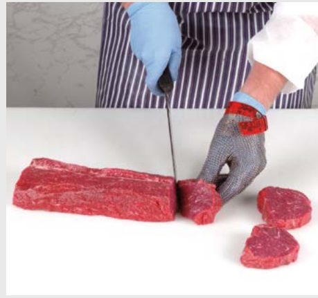
10. Cut into individual portions.