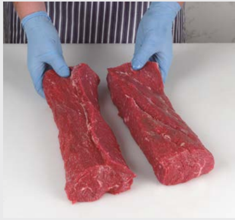
9. into two, lengthways.